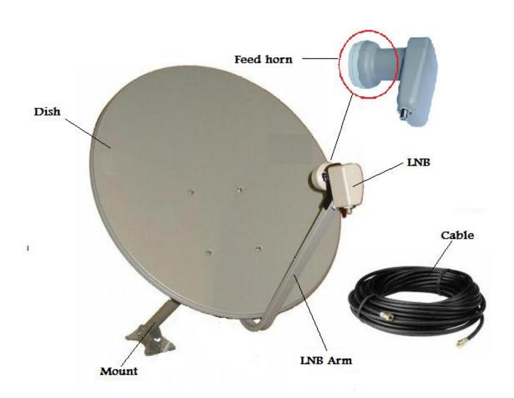
Figure 1. Illustration of Satellite Receiving Antenna (SRA)

Components of Satellite Receiving Antenna (SRA);